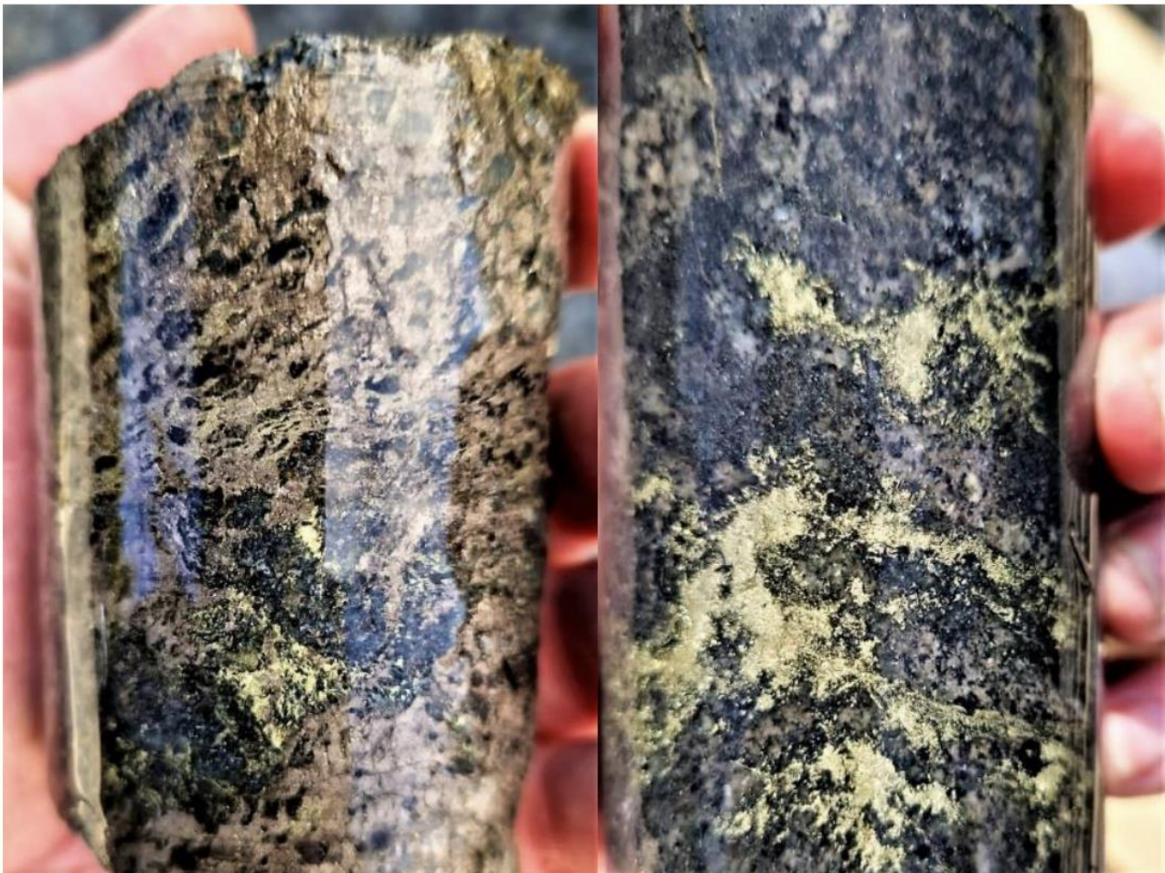
Drill hole VUO23012. Clusters of massive sulfides (pyrrhotite, pentlandite, chalcopyrite)

The mineralization is confined to a flat-lying body in the basal section of a gabbroic intrusive at the contact with an underlying granite and is open to the northeast. Assay results are expected in late August.